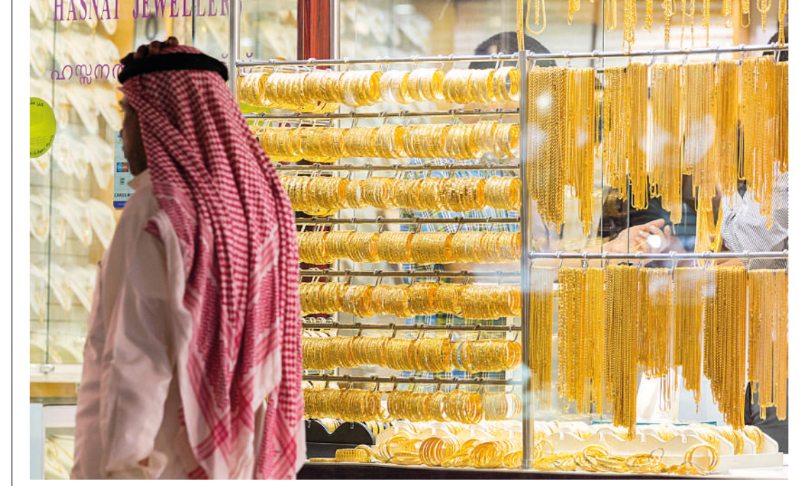
A gold store at the Dubai Gold Souq. UAE residents are mostly holding onto their gold assets and not selling even after the yellow metal hit a record high.

Economists had expected a gain of 239,000 jobs in March, with hourly wages seen rising at a 4.3 per cent annual rate and the unemployment rate remaining at 3.6 per